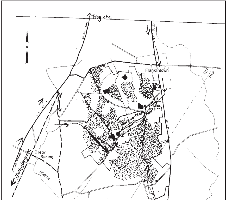
PA GAME LANDS #243 HUNTING TEST HEADQUARTERS